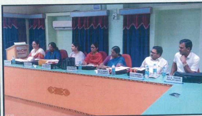
Director, NICM, Chennai and Faculty interacting with JRCS/Faculty from Telengana State Cooperative Union