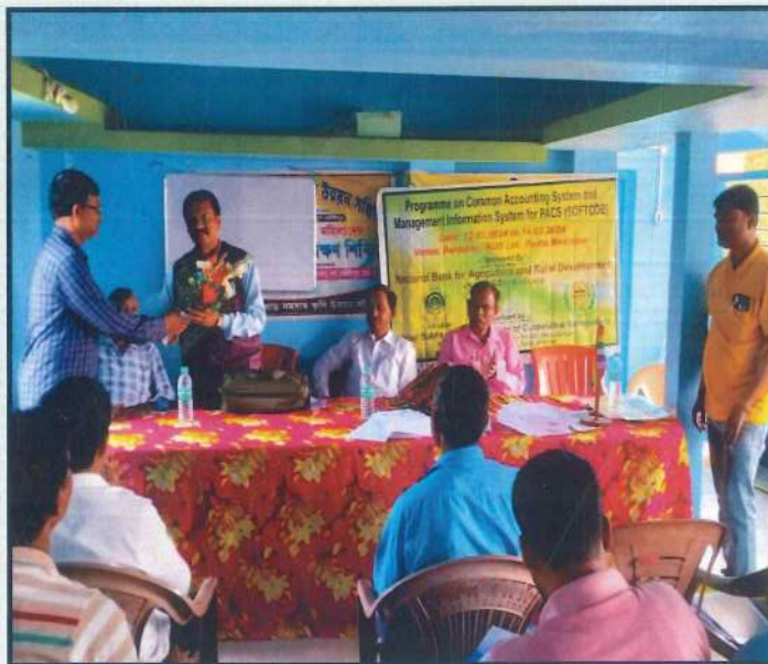
A 3 days Training Programme on Common Accounting System and Management Information Systems (CAS&MIS) for Managers and Employees of PACS sponsored by NABARD under SOFTCOB Scheme was organized by NSRICM Kalyani from 12.03.2024 to 14.03.2024 at Kolaghat Block of Purba Medinipur District