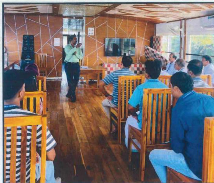
NABARD sponsored SOFTCOB Programme organized by ICM Thiruvananthapuram at Karthikapally from 12-14 February 2024