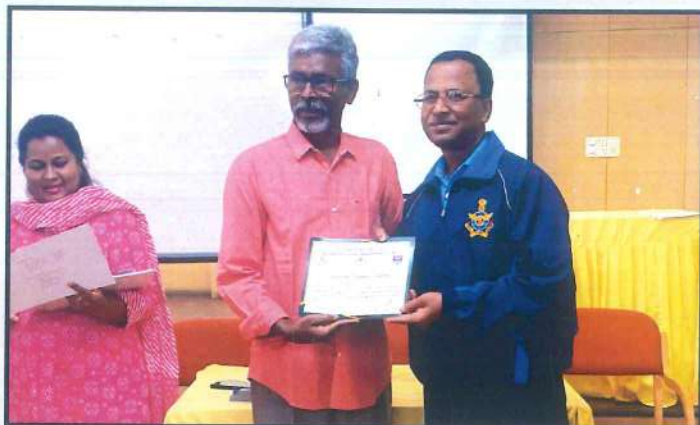
RICM, Bangalore hosted Valedictory ceremony of the DGR "Web Developer" Course. 01.03.2024