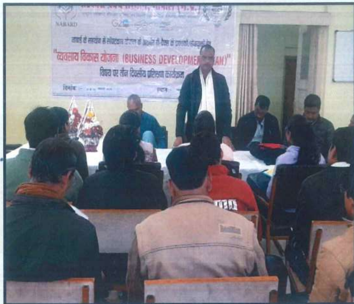
Inauguration of NABARD Sponsored SOFTCOB Training Programme on "Business Development Plan" for Managers / Secretaries/Assistant of PACS at DCCB Guna conducted by Institute of cooperative Management Bhopal on 22.01.2024 (22-24 January 2024).