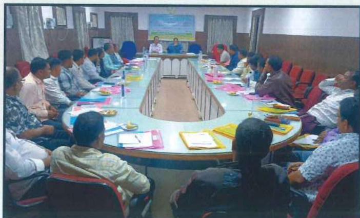
SOFTCOB programme on Developing PACS in MSC for the Secretaries of PACS was conducted by ICM, Bhubaneswar at Angul from 18.1.2024 to 20.1.2024

C-PEC, NABARD and NCCT signed MOU to organize programmes for PACS, functionaries and DCCB Staff on various identified topics under SOFTCOB Scheme. Accordingly all the units have organized and trained participants upto December, 2023