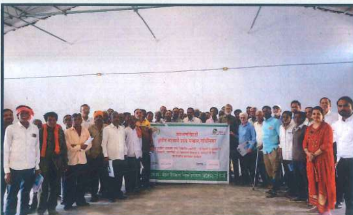
A One- day awareness program for Farmers of Sundan PACS, Anand was organized by RICM, Gandhinagar on 27 th February, 2024 at CWC, Vadod, Anand. The programme was attended by 55 farmers and sponsored by WDRA, New Delhi