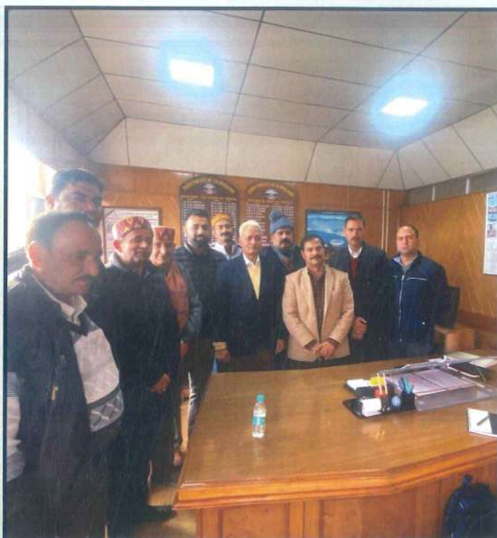
The Programme Advisory Committee meeting of RICM, Chandigarh for the academic year 2024-25 was held on 04.03.2024 in the Chamber of RCS, Shimla (Himachal Pradesh)