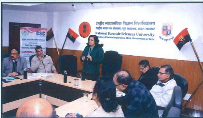
Technical Sessions during Day Two of the Programme