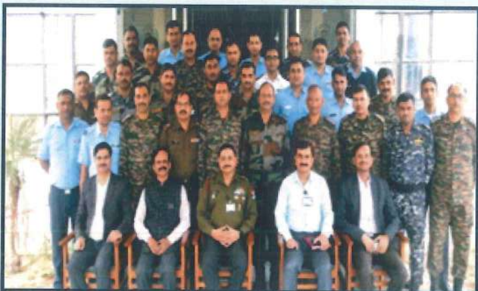
भारतीय रक्षा के तीनों विंगज के रक्षा कर्मियों हेतु सहकारी प्रबंध संस्थान, लखनऊ द्वारा आयोजित औद्योगिक सहकारी प्रबंध में डिप्लोमा (08.01.2024 से 29.03.2024)