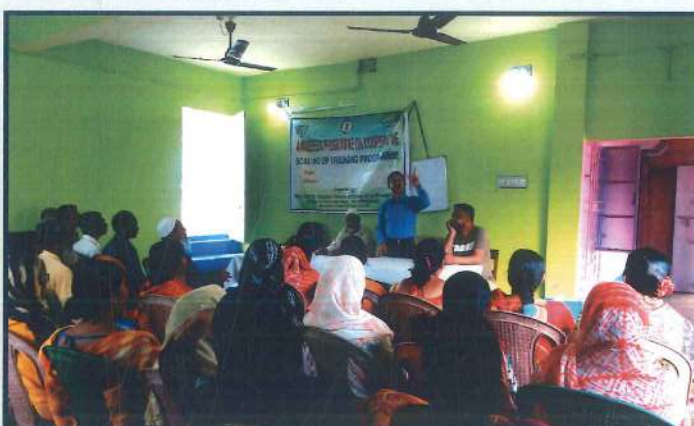
A Scaling up program was organized by RICM, Kalyani at Kadambagachi PACS Ltd, Nadia district on 07.03.2024