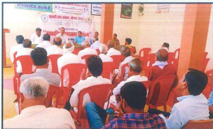
सहकारी प्रबंध संस्थान, भोपाल द्वारा दिनांक 02.03.2024 को बी-पैक्स-घुघरियाखेड़ी, जिला खरगौन (म. प्र.) में Scaling up के अंतर्गत सहकारिता जागरूकता कार्यक्रम आयोजित किया गया