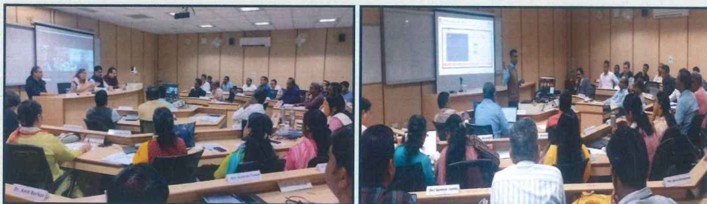
Technical Sessions being conducted during the Programme