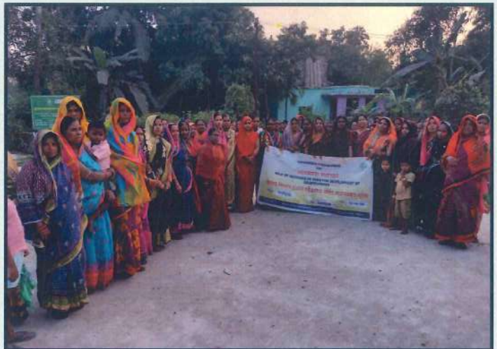
Sahakar se samridhi programme was conducted for the women cooperators by ICM, Bhubaneswar on 10.2.2024 at Darbachha, Maitri GP.