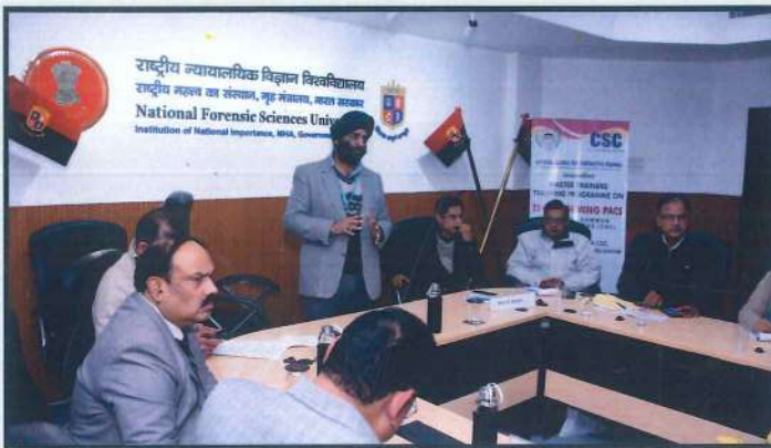
Technical Sessions during Day One of the Programme