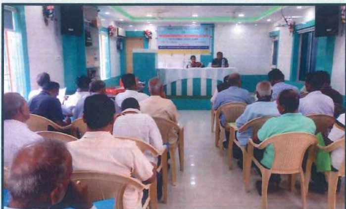
An Awareness programme on WDRA Act was conducted by ICM, Bhubaneswar on 10.02.2024

NCCT and WDRA signed MOU to organize training programmes and awareness programmes for Farmers/Members of PACS, Millers, Dealers and Warehouse through training units of NCCT.