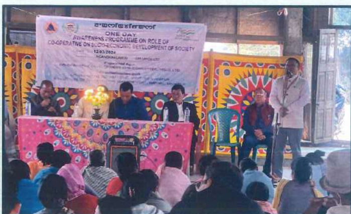
An Awareness Programme on Scaling up of Cooperative Awareness Programme for PACS was conducted by ICM, Imphal at Khangkhalawai GPLMPCS Ltd, Moirang, Bishnupur District, Manipur on 12.03.2024