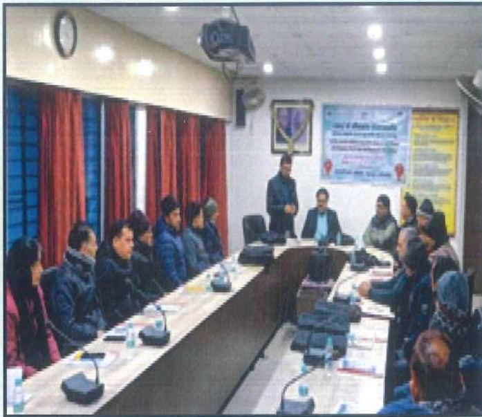
A Three Days NABARD Softcob Training Program on "Developing PACS into MPACS for Secretaries of PACS / MPACS", 26 MPACS Secretaries/Accountant was organized by ICM, Dehradun from 10.01.2024 to 12.01.2024 at Haldwani in Nainital Dist. Cooperative Bank.