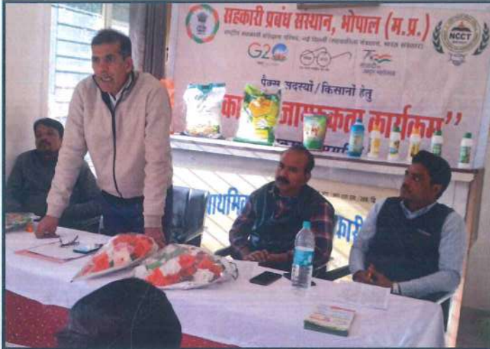
Cooperative Awareness Programme under scaling up of Training for Members of PACS/Farmers conducted by ICM, Bhopal at Primary Agricultural Credit Cooperative Society, Sanchi, Distt. Raisen (MP) on 24.01.2024

Scaling up Programmes for creating awareness among cooperatives and prospective entrants into cooperative sector and various initiatives of Ministry of Cooperation, Govt. of India was taken up by all the units. This one day programme provides for inputs to be given on the cooperative sector, initiatives of the Ministry of Cooperation through awareness programmes. This programme helps to understand the cooperative societies in a better way and what all the activities the owner members of the cooperatives can take up to fulfill this economic and social needs.